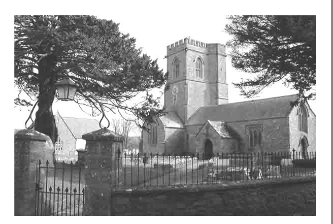
St Mary's Church

Sunday 4<sup>th</sup> December 2016 Advent 2